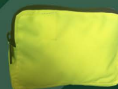
Large Soft Pouch 22cm wide 17cm high 4cm deep