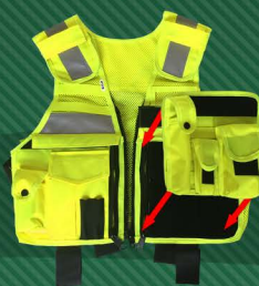
Velcro - Removable Pouches