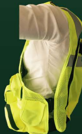
Strap Sides (Adjustable)