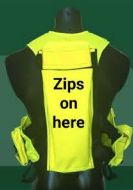
Hydration System (zip-on back)