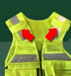
Front Shoulder Straps