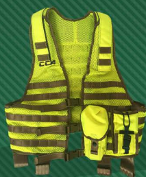
Modular Attachable Pouches (MOLLE)